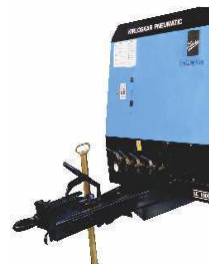
Heavy Duty Adjustable Tow Bar